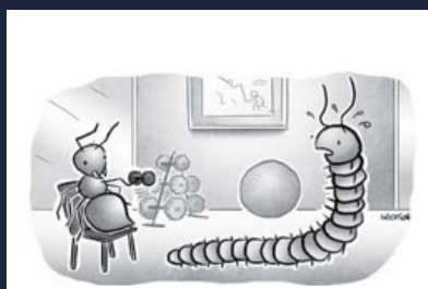
"Man I hate leg day."